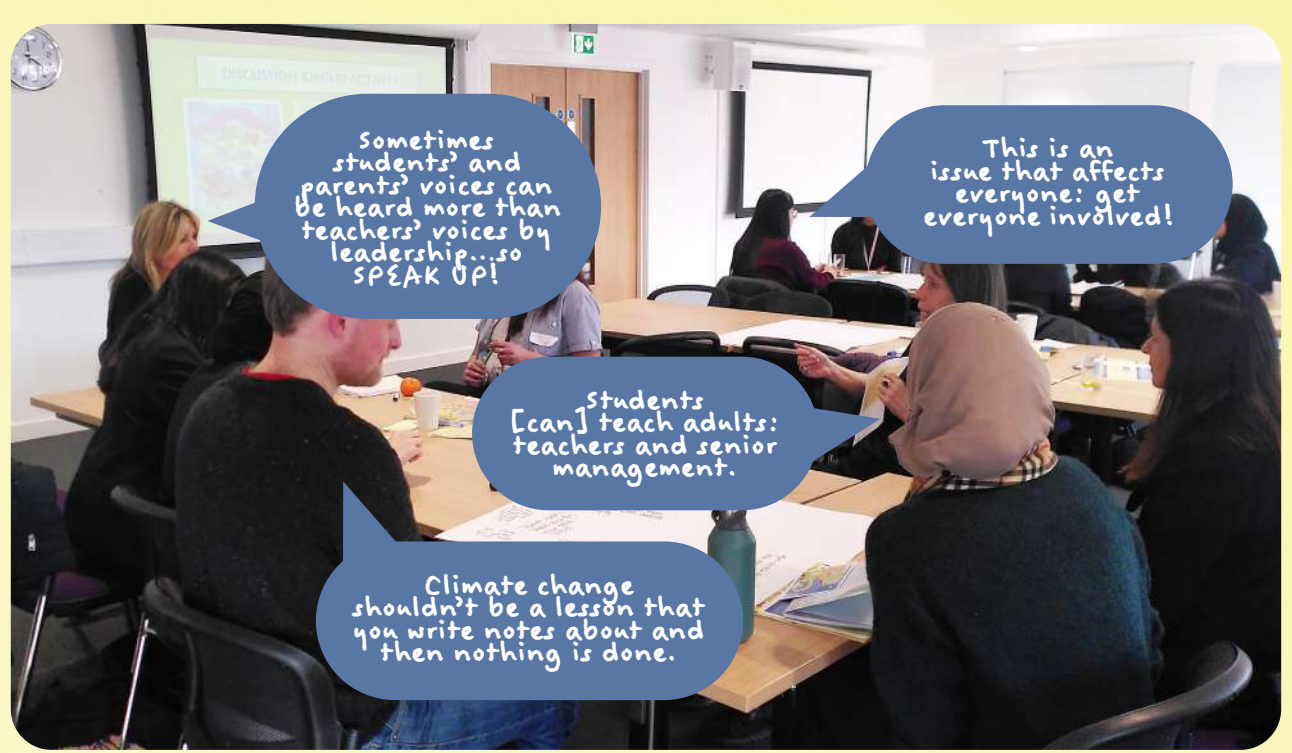
All photos are used with permission. Quotes are positioned for illustrative purposes, and were not necessarily shared by those next to speech bubbles.